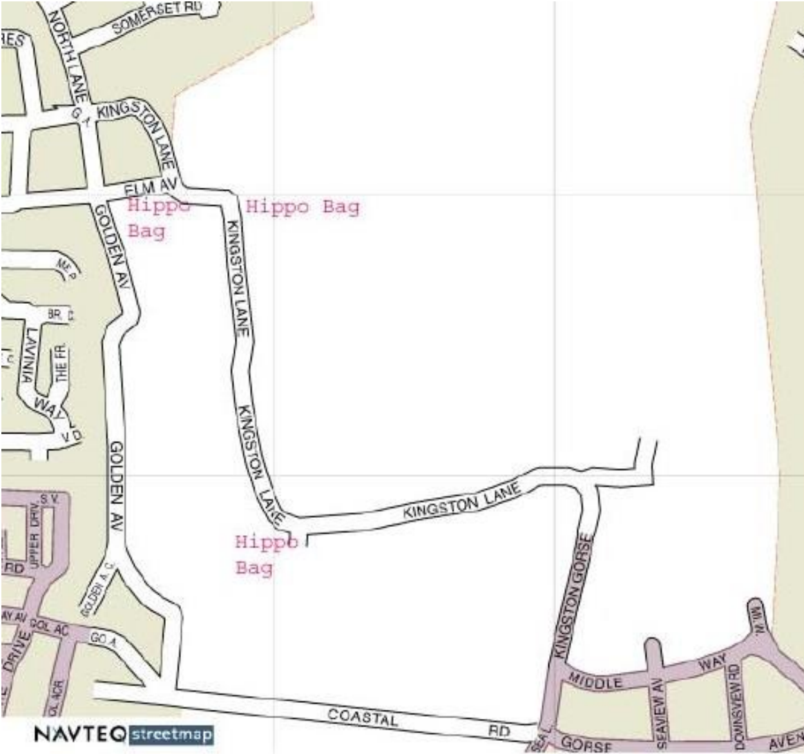
Map showing salt bins (labelled hippo bags) and Kingston Lane parish gritting route